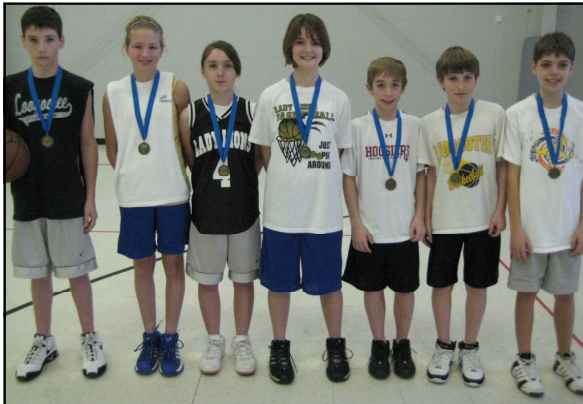
District Free Throw Champions