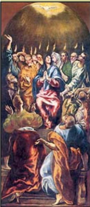
Feast of Pentecost May 31, 2009