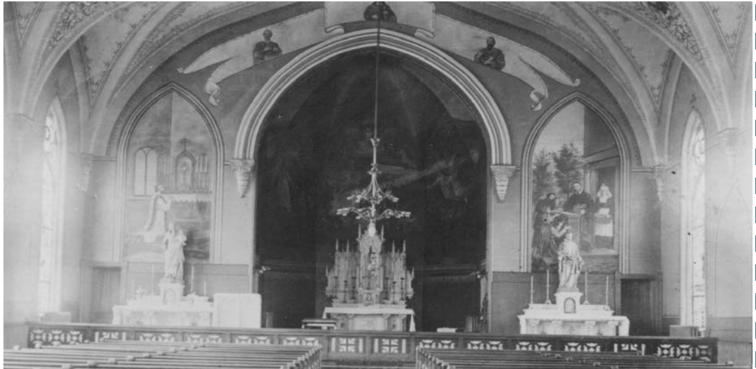
St Vincent de Paul interior in 1894

Non Profit Org. US Postage Paid Permit No. 214 Bedford IN